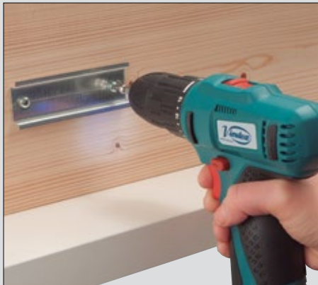
Compact, powerful and easy to use.