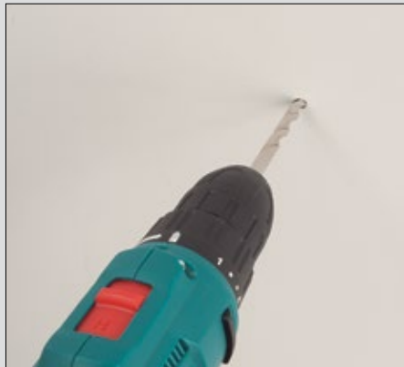
Fast locking drill chuck